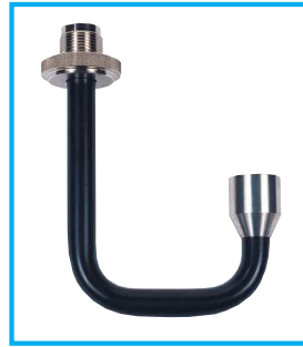
FIG 24 VACUUM ADAPTOR

Stainless steel adaptors available in various sizes of Metric, BSP and NPT thread. Dual gauge stand for simultaneous calibration of two instruments.